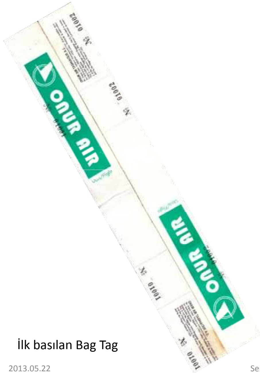
İlk basılan Bag Tag