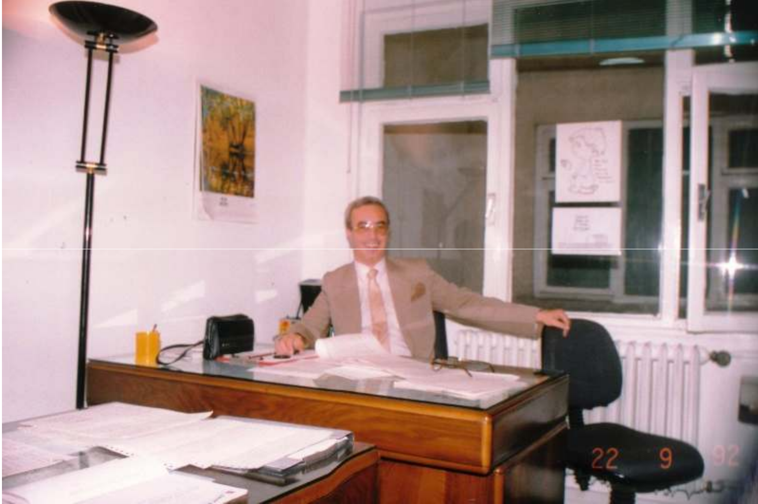
Onur Air zamanlarından.